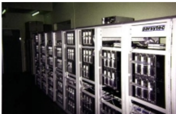
Figure 2: The 128-node DAS cluster at the Vrije Universiteit.

This setup allowed us to compare a dedicated fixed Quality of Service network with a best effort network. The best effort network consists generally of 100 Mbit/s Ethernet connections to a local infrastructure; each university typically had a 34 Mbit/s connection to the Dutch backbone, later increased to 155 Mbit/s. The ATM connections are all 6 Mbit/s constant bitrate permanent virtual circuits. The round trip times on the ATM connections have hardly any variation and typically are around 4 ms. On the best effort network the traffic always has to pass about 4 routers, which cause a millisecond delay each. Measurements show that the round trip times vary by about an order of magnitude due to the other internet traffic. Attainable throughput on the ATM network is also constant. On the best effort network, the potential throughput is much higher, but during daytime congestion typically gives throughputs of about 1-2 Mbit/s. This problem improved later during the project.